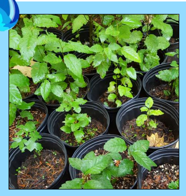
We donated over 400 trees for res toration at Canby Sand & Gravel. Bureau of Land Management donated bare root trees & Sunflower Farms donated pots, while MRW bought soil & potted the trees.

Planting native species completed on a 2.5 acre riparian streambanks & floodplain project funded by Oregon Watershed Enhancement Board.